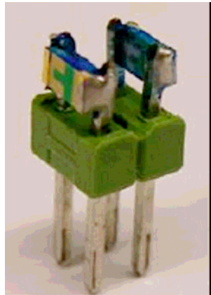
LED sensor platform example developed in Dublin City University