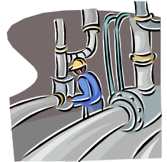
Speciation of Petroleum Refinery Process Streams