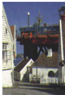
The Oil Industry is Visible in Stavanger

At the General Session on the morning of June 29, there were presentations from several international environmental research organizations, including SINTEF (Norway), the Rogaland Research Center