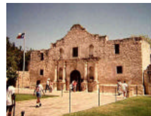
The Alamo San Antonio, Texas